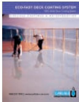
ECO-FAST Deck Coating System