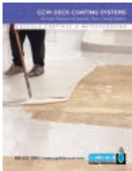
CCW Deck Coatings

CCW provides a complete line of waterproofing solutions and the expertise to help you select the one that is best for your project.