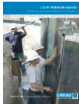
CCW MiraDRI 860/861