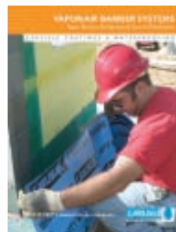
Vapor/Air Barrier Systems